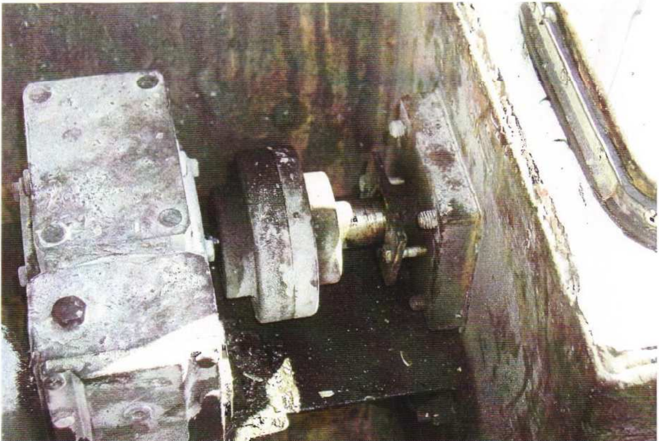
Photograph #7, taken 4/19/2003. The west-side skimmer drive rod, as pictured, was the location of VOC emissions.